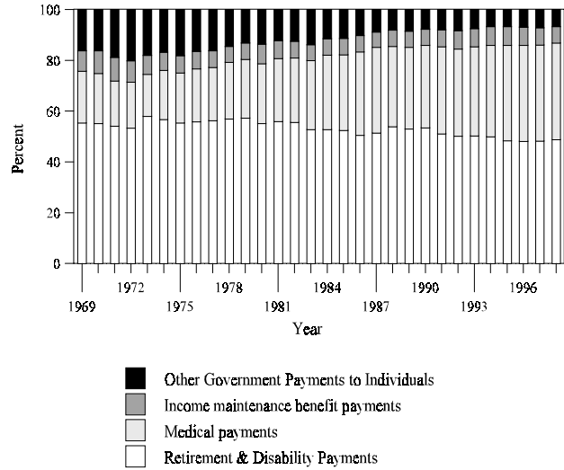
Government Transfer Payments to Individuals Percentage Distribution in North Dakota: 1969-1998

Source: U.S. Department of Commerce, BEA, REIS, Table SA35, May 2000.