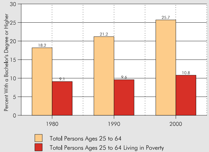
Figure 1. Of All Persons Ages 25 to 64 and Of Persons 25 to 64 Living in Poverty; Percent with Bachelor's Degree or Higher in North Dakota